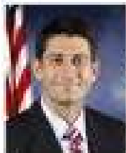
Rep. Paul Ryan