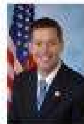
Rep. Sean Duffy