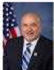
Rep. Mark Pocan