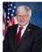
Rep. Glenn Grothman