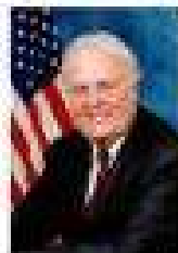
Rep. Jim Sensenbrenner