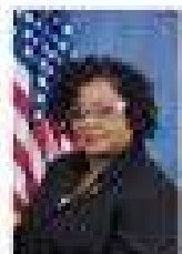
Rep. Gwen Moore