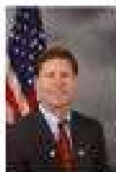
Rep. Ron Kind