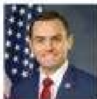
Rep. Mike Gallagher