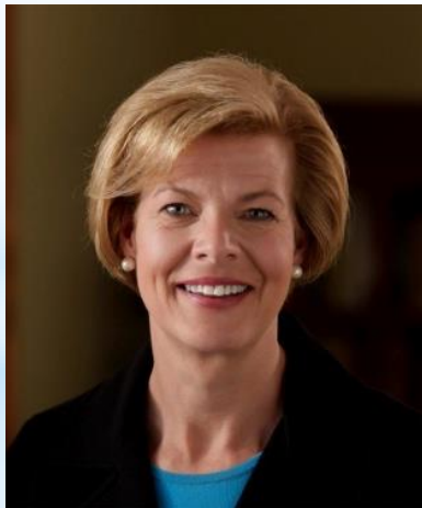
Sen. Tammy Baldwin DC Office: (202) 224-5653