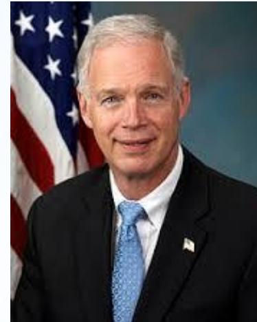
Sen. Ron Johnson DC Office: (202) 224-5323