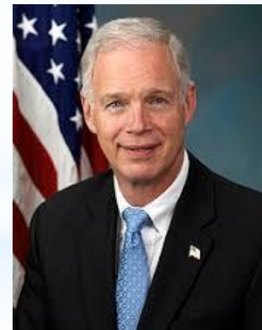
Sen. Ron Johnson DC Office: (202) 224-5323