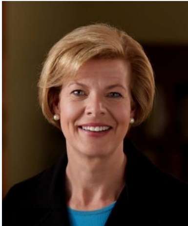
Sen. Tammy Baldwin DC Office: (202) 224-5653